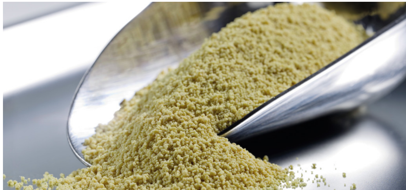
↑ Optimum product properties due to continuous fluidized bed processes

High efficiency and great innovation potential in bulk production