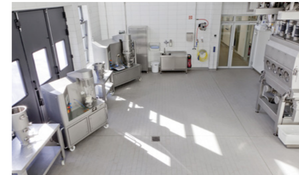
↑ Numerous test options in the pilot plant

With its high level of expertise in fluidized bed technology and its modern pilot plant, AMANDUS KAHL is an experienced partner and companion in the research, development and production of high-quality machines and products.