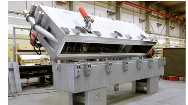
↑ Continuous fluidized bed plant with access via the open exhaust air hood